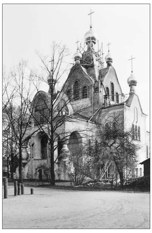
Photo 1. St. Alexander Nevsky church in Tartu. ERM Fk 2745:987

versary of the parish in 1939, the Estonian Apostolic Orthodox Church was attached to the jurisdiction of the Russian Orthodox Church as a consequence of the Soviet occupation. In 1962, Karlova kirik was closed due to another cycle of atheistic repressions in what was then Khrushchev's Soviet Union. The church building was transferred to the Estonian National Museum in 1984, which preserved in it part of its collections. The atheistic policy was applied along with economic mechanisms targeting, among others, the de-Estonianisation of the Orthodox institutions, in addition putting the latter in an unequal position by applying excessively high rents for the (state expropriated) church buildings: "The Estonian parishes had to pay rent to the Soviet state - and the rent included the air too. A lot of parishes had to cease their existence." (Father Orenti, personal interview, 16.09.2009)