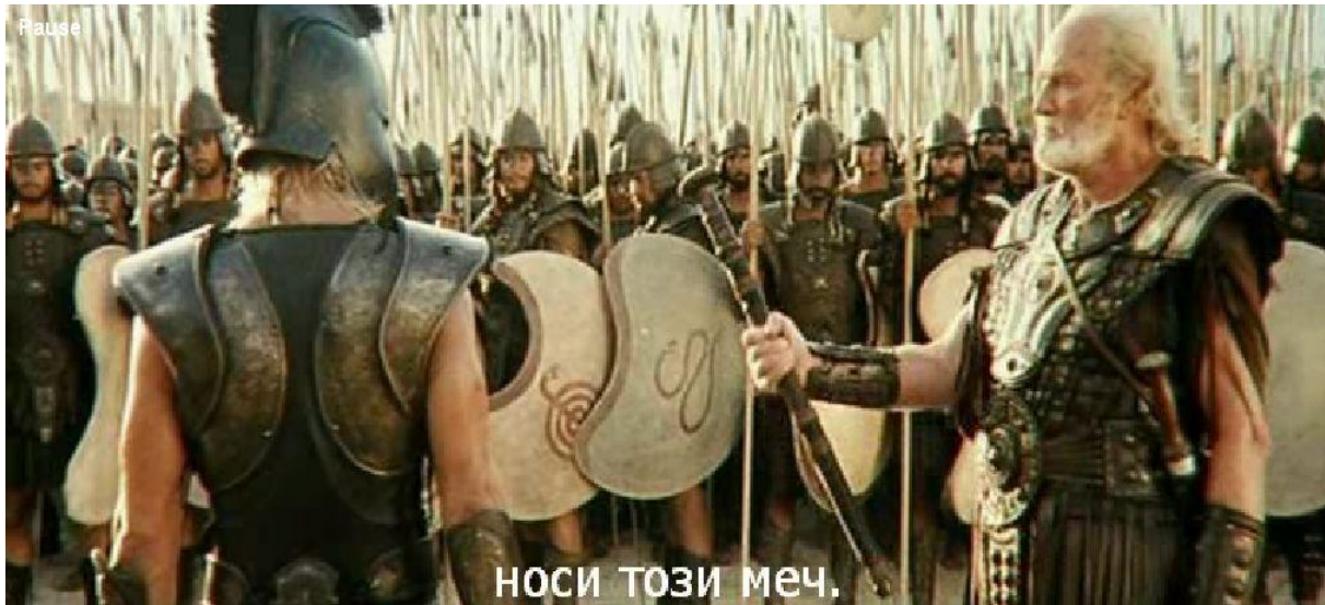
Figure 2. Screenshot from the film Troy (2004)

Other researchers (Shiptchanov, 2013) have also analysed translator's mistakes. Figure 2 represents one such mistake with realia.