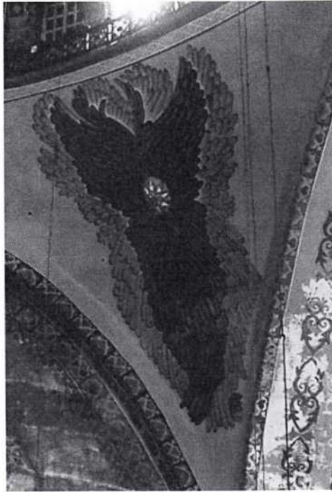
Picture 5a. One of the four seraphim mosaic in Hagia Sophia, Istanbul (Constantinople)

The Ottoman decision is understandable because the concept of this image is special. The four seraphim communicate with the visitor through the perfect knowledge of the Old Testament, because the vision includes a blue color marking the pavement under the Throne of the Lord (Ex 24:10) and „a sapphire stone, as the appearance of the likeness of a throne“ (Eze 10:1). There are neither hands nor attempt to preserve the fiery nature of the seraphim through red and yellow. Pendentives of the Great dome with the four seraphim, preserved by the Ottomans. Before the Muslims changed the decorating the dome was located Christ Pantocrator.