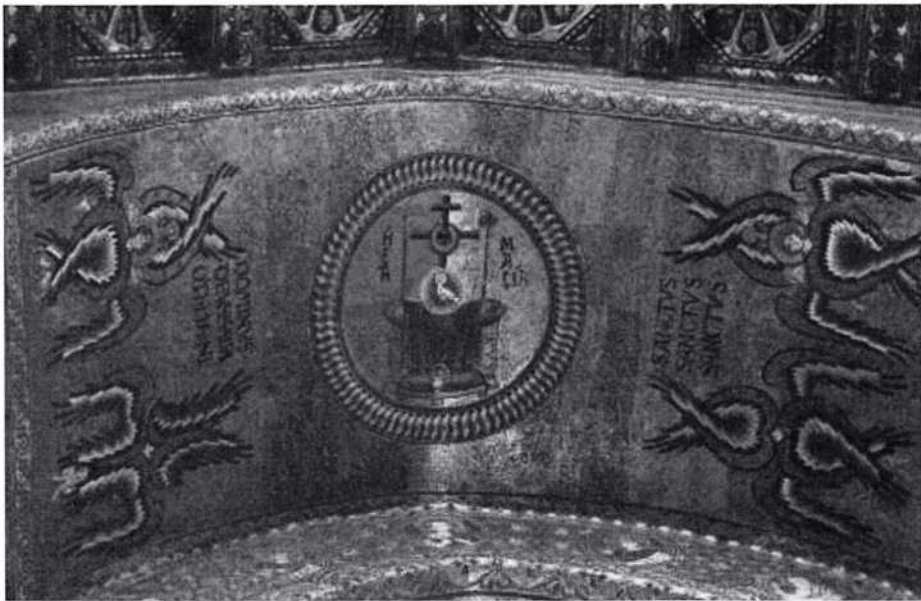
Picture 3. Monreale Cathedral (1172–1267), center apse, Throne of the Second Coming, Italy, Sicily

Origen assumes that Christ is part of the angel hierarchy and perceives Jesus Christ as his guardian angel. Origen binds the threefold glorification of God from the seraphim with the Trinity. (Origen De Principiis , chap. III. 5. On the Holy Spirit). See Pictures 3 and 4.