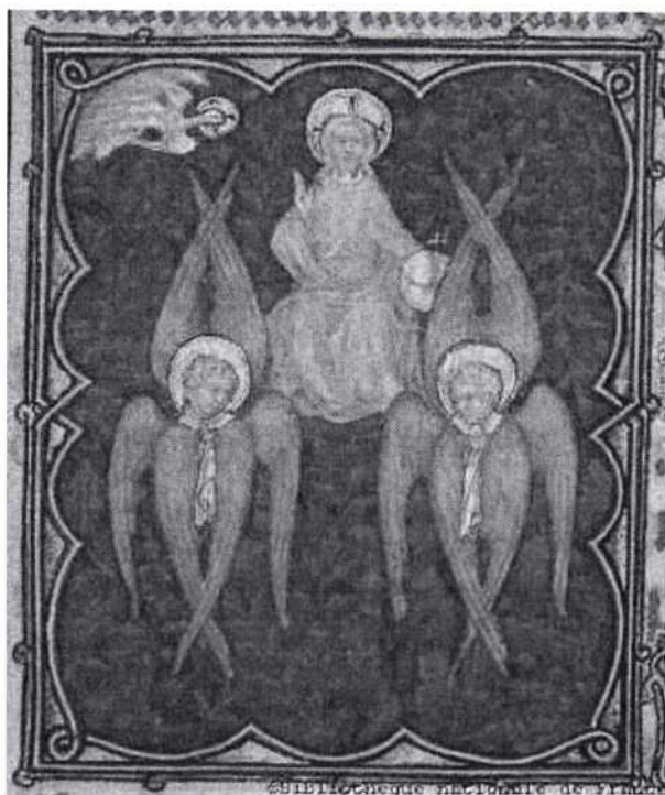
Picture 2. God surrounded by seraphim. Limbourg brothers, from the Petites Heures de Jean de Berry , between 1375 and 1390.

The fiery paradigm of the Sin-Reish-Fe is fully preserved in modern Hebrew. It is important to note that the root does not form any words with the Shin variant. This means that the possibilities of interpretation are limited in regard to the game of Shin and Sin in different word forms.