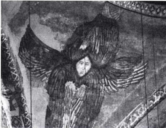
Picture 5b. The only one face revealed due to the status of a museum of the basilica Hagia Sophia, Istanbul (Constantinople)

The Ottomans plastered all the images except the four seraphim. The only change in seraphim is that they hide the four faces. There are two hypotheses about what is under the golden lids. One hypothesis is that there are four different faces – human, lion, eagle, and bull – behind the golden lids. And this is inwoven into the mosaic of what was said in Ezekiel 1. In Chapter 10, Ezekiel replaced the „bull's face“ with a „cherubic face“ (man, cherub, eagle, lamb). Today only one of these faces has been revealed – the human one – due to the status of a museum of the basilica.