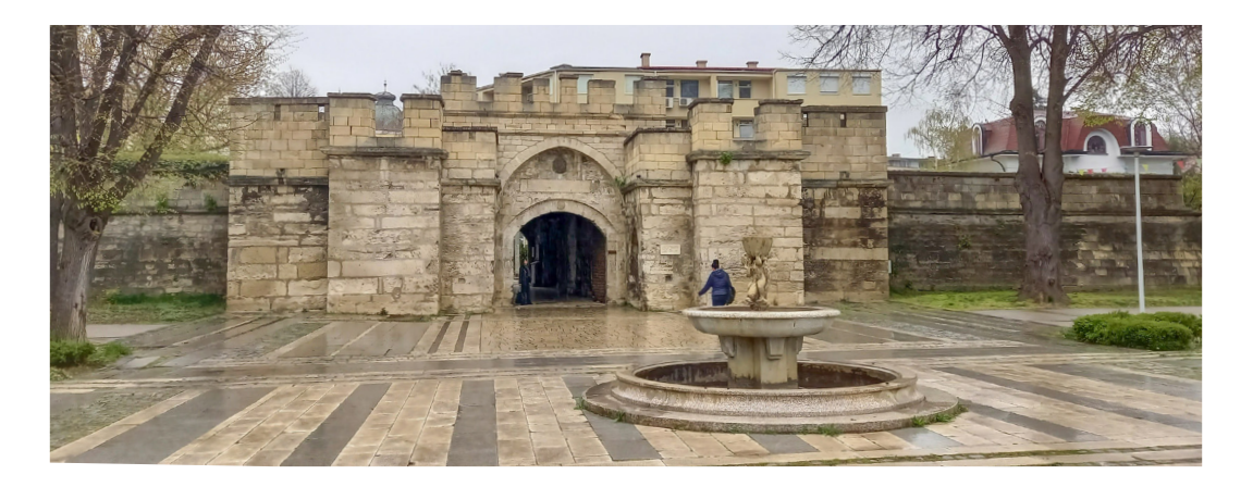
Fig. 44_43 / The refurbishment of Vidin synagogue on the Danube riverfront historic promenade (Author: G. Georgiev)