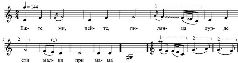
Fig. 4. Print view of a song notes

The main object in the library is a song. The song consists of four items: notes, lyrics (the text of the song), music, and manuscripts. The notes are presented in a form of LilyPond coding [6] (plain text files, Fig.3) and print view (pdf and eps files, Fig.4). Now we have about 1100 songs with notes and text.